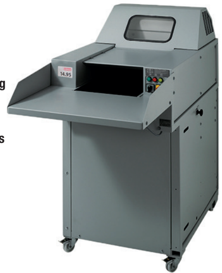
W/D/H 80/120 x 168 x 164 cm