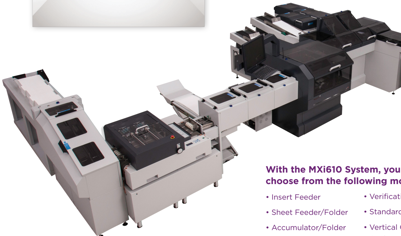
MXi610 Envelope Insertion System