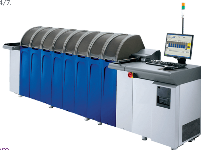
MX6100 Card Issuance System

Service and support: The MX Series Systems are supported by the industry's largest service and support network, which spans more than 150 countries worldwide. Online and phone support is available 24/7.