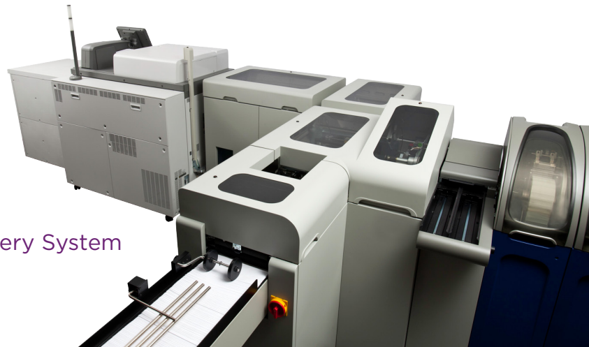
MXD611 Card Delivery System

Support market trends: Meet the growing vertical card trend without limiting job sizes based on card orientation. Dynamically place cards on carriers horizontally and vertically to meet customer requests.